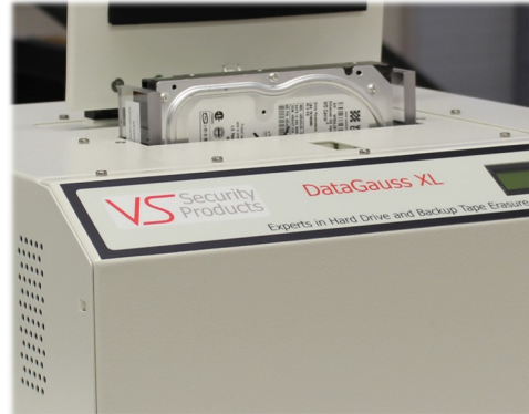
XL Adapter installed